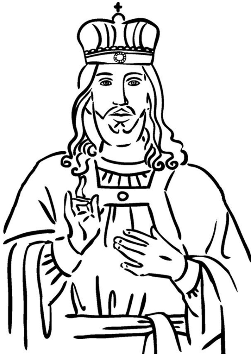
Christ the King John 18:33-37