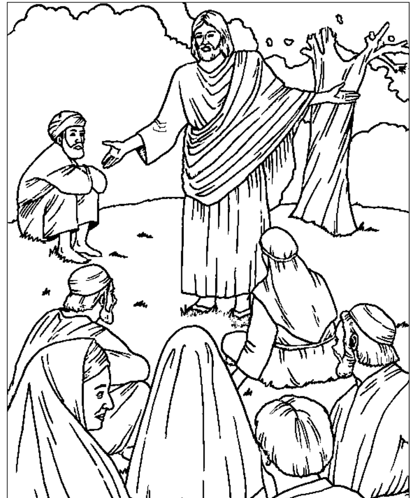
The Sermon on the Mount Matthew 5:1-12

From BibleStoryCard Learning System(tm) Coloring Book © 1996 Wesleyan Publishing House. Used by permission. Additional BibleStoryCard resources are available by calling 1-800-493-7539 or visiting online http://www.wesleyan.org/941/biblestorycards