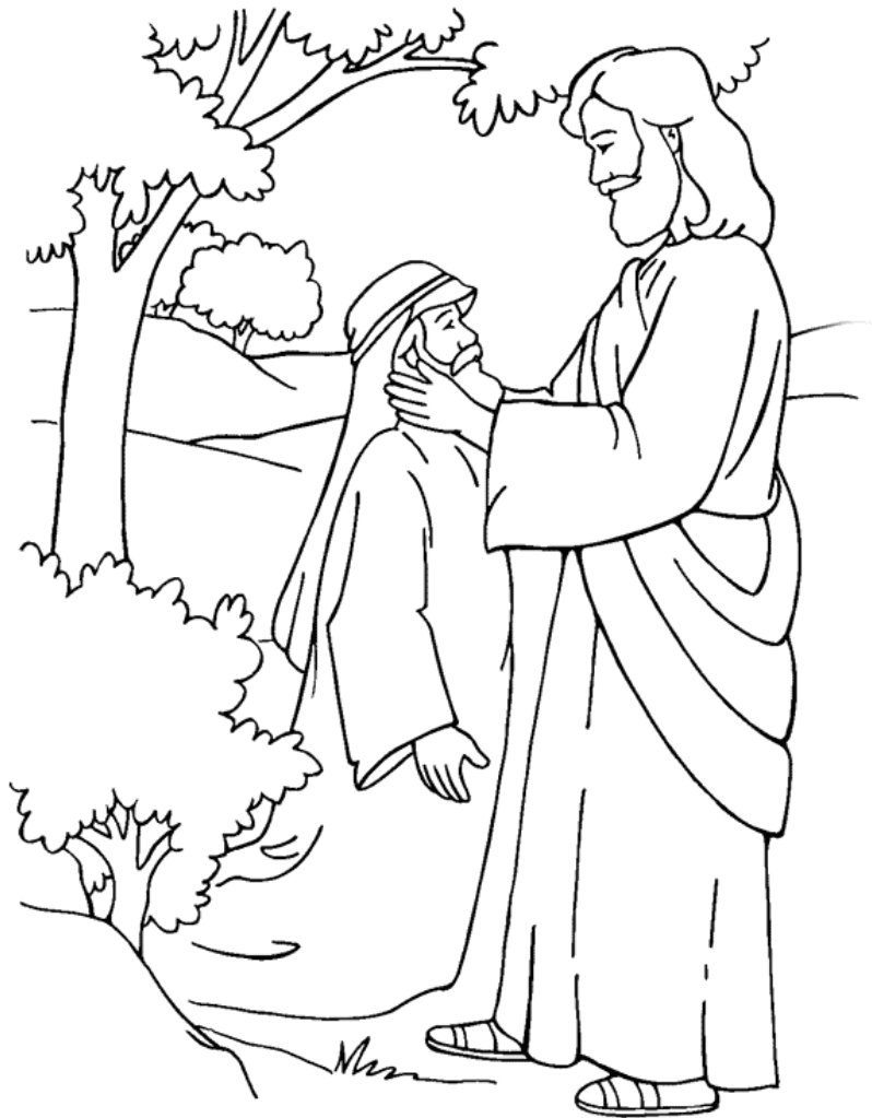
Jesus Heals a Deaf Man Mark 7:31-37

From Thru-the-Bible Coloring Pages for Ages 4-8. © Standard Publishing. Used by permission. Reproducible Coloring Books may be purchased from Standard Publishing, www.standardpub.com , 1-800-543-1301.