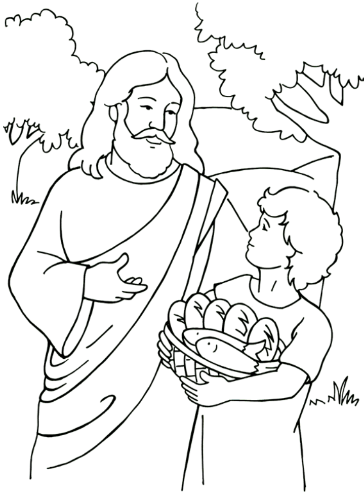
Jesus Feeds 5,000

From Thru-the-Bible Coloring Pages for Ages 4-8. © Standard Publishing. Used by permission. Reproducible Coloring Books may be purchased from Standard Publishing, www.standardpub.com .