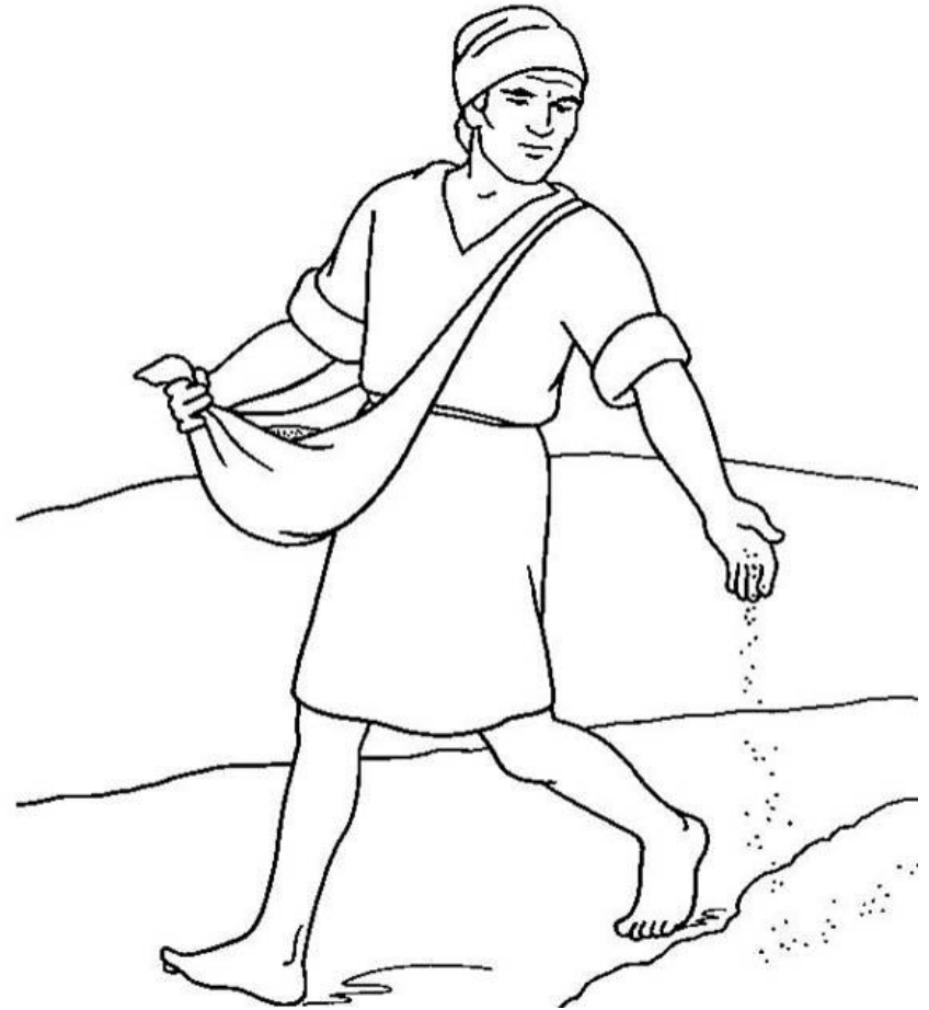
The Parable of the Seed Mark 4:26-29

Color the picture of the worker planting the seed.